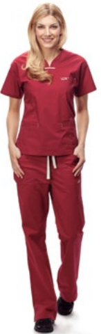
MERLOT W/ CELERY TRIM *