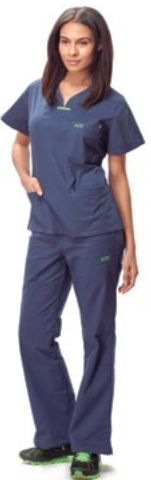
NEWPORT NAVY W/ IGUANA GREEN TRIM *