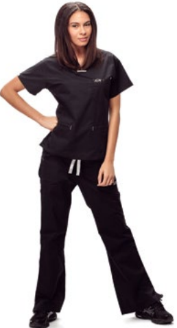
ECLIPSE BLACK W/ TITANIUM TRIM *