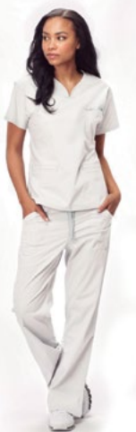
WHITE W/ WHITE TRIM (ALL 1 COLOR)