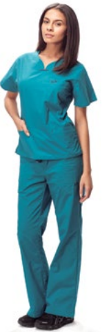
TEAL W/ NAVY TRIM