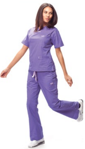
TOKYO PURPLE W/ CARMINE PINK TRIM