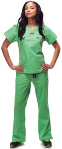
IGUANA GREEN W/ NAVY TRIM