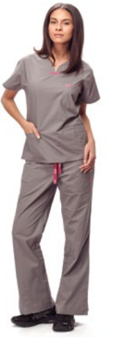
CITY SLATE W/ POWER PINK TRIM *