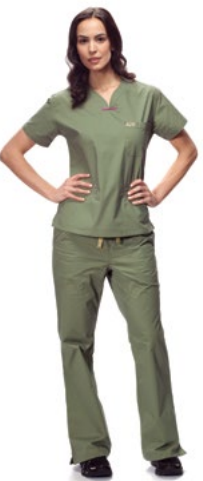
VINTAGE OLIVE W/ PEAR/PURPLE BLAZE TRIM *