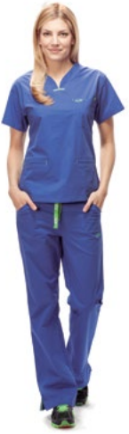
AZURE BLUE W/ IGUANA GREEN TRIM *