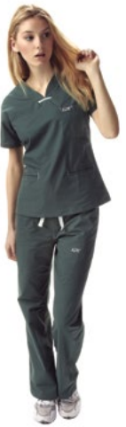
TREELINE GREEN W/ CELERY TRIM