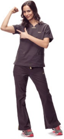
CARBON BLACK W/ PEAR TRIM *