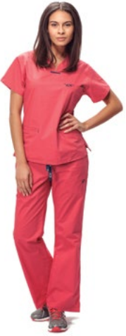
GUAVA W/ NAVY TRIM