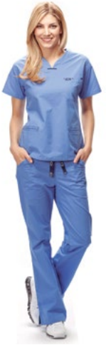
CELL BLUE W/ NAVY TRIM *