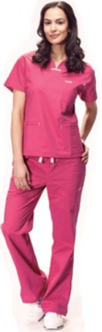
POWER PINK W/ CARMINE PINK TRIM *