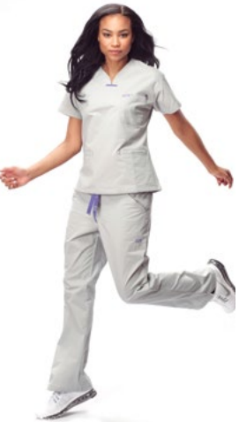
HEATHER GRAY W/ TOKYO PURPLE TRIM