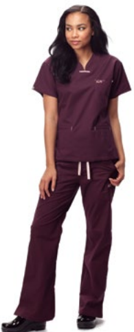
WINE W/ CARMINE PINK TRIM *