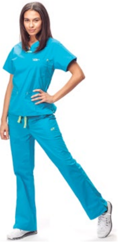
BORA BLUE W/ ELECTRIC YELLOW TRIM