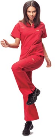
MACINTOSH RED W/ PEAR/CARBON BLACK TRIM