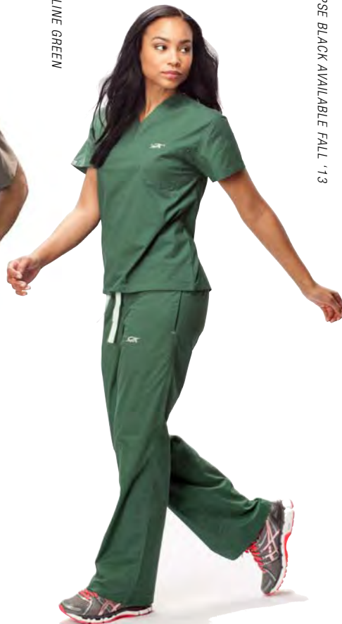
ECLIPSE BLACK AVAILABLE FALL '13