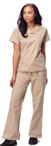
SAHARA TAN W/ PEAR/CARBON BLACK TRIM