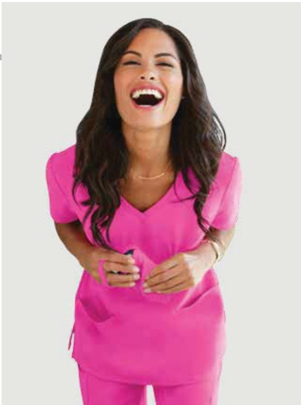
“SOFIA” TOP COLOR: HOT MAGENTA

SCRUBS When you look at the Careisma by Sofia Vergara line, the colors, the fit, the prints, all scream “Sofia” to me. How did you choose them?